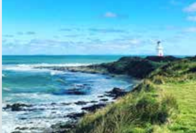
Waipapa Point