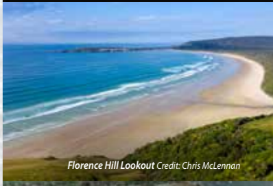
Florence Hill Lookout