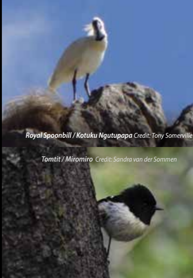
Royal Spoonbill / Kotuku Ngutupapa