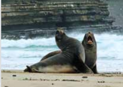
Sea Lions / Whakahao at Pāraikaunui Bay